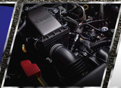
1.5L* 4 Cylinder, In-line, 16 Valve DOHC, Chain Drive with Dual VVT-i Engine