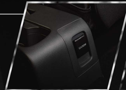
Front and Rear Accessory Connectors

A next generation multimedia hardware connected to the T-Link App for better smartphone integration.*