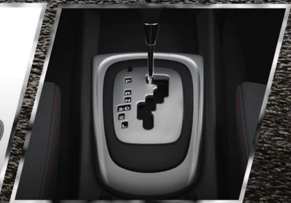
Gate Type 4-speed Automatic Transmission