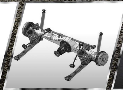
4-link with Lateral Control Rod rear suspension