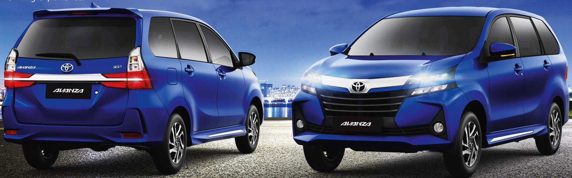
Featured variant: 1.5 G in Dark Blue SE

With an efficient and reliable engine, the new Avanza gives you worry-free performance on the road for a smooth driving experience.