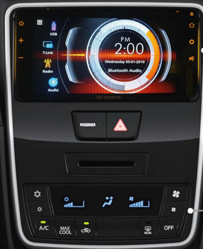
Digital Display Air Conditioning

Make your ride more enjoyable and convenient with a smarter interior from the new Avanza.