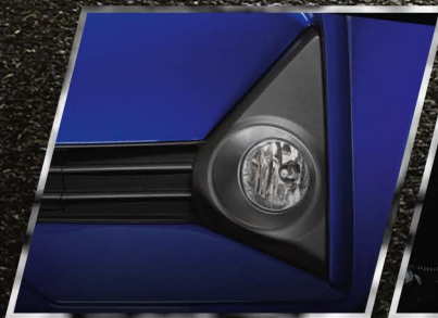
Front Fog Lamps*