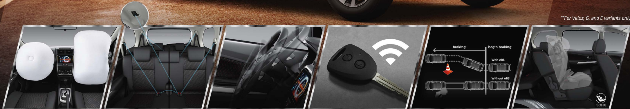
2 SRS airbags for the driver and passenger seats