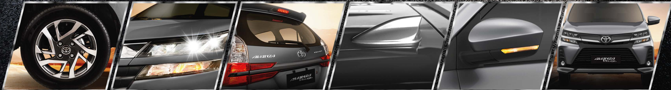
Newly designed 15-inch alloy wheels*

*For Veloz and G variants only **For Veloz, G, and E variants only